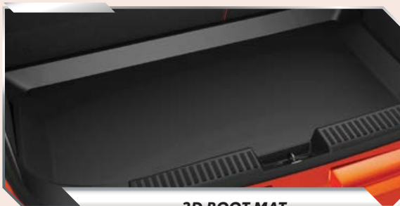
3D BOOT MAT