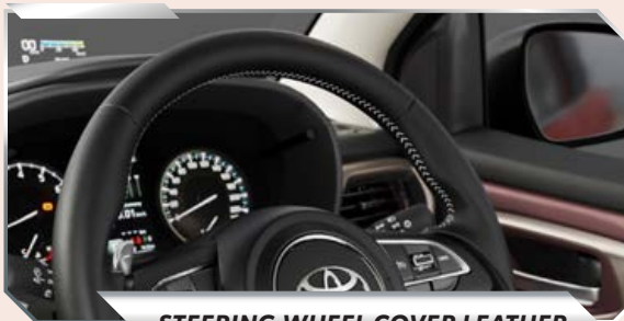
STEERING WHEEL COVER LEATHER