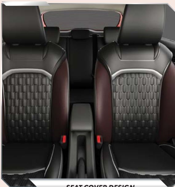
SEAT COVER DESIGN