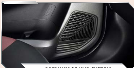
PREMIUM SOUND SYSTEM