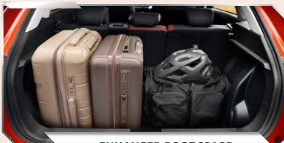
ENHANCED BOOT SPACE